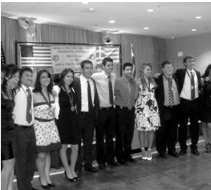
The youth of the District pose after receiving their medals and awards at the Friday night Youth Awards Night during the District Convention.