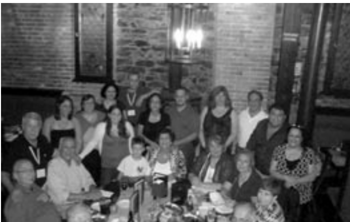
The Ahepans and Daughters of District 5 pose for a group shot while out to dinner in Montreal's Greek Town.