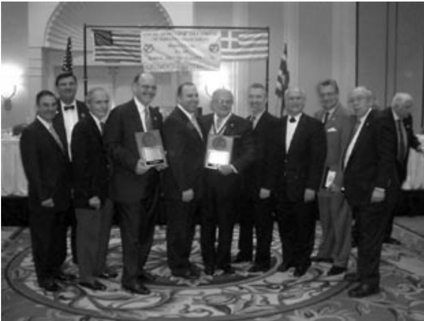
Chapter of the year Ramapo Chapter #453

54 led the district and nation in the greatest increase in membership. Also, the Ramapo chapter, and the Trenton chapter were also recognized for their contributions regarding their membership increases. Also highlighted in the report were two successful district workshops, visitation to and fundraising for Saint Basil's, the Biennial Regional Congressional Banquet, participation in both the Philadelphia and New York City Greek Independence Parades, and the tremendously successful district wide cultural events highlighting our Byzantine Metropolis choir, amongst other events.