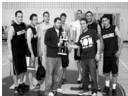
The champions from Middlesex with their first place trophy.

This past May, the Wyckoff Sons of Pericles Patritha Chapter #317 hosted the 4th annual East Coast Regional Basketball Tournament at St. Nicholas in Wyckoff. The tournament took place on May 9th and 10th and included a weekend full of events, highlighted by the nine team tournament.