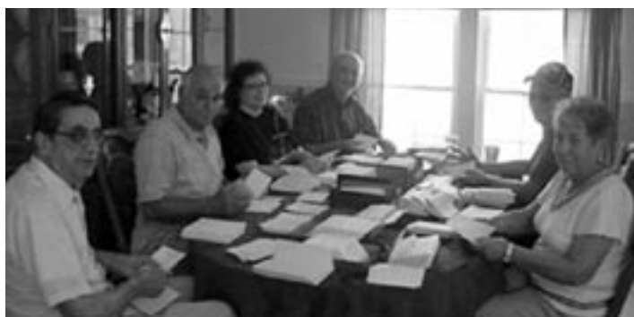
Members of the Board of Trustees and friends of the Fifth District AHEPA Cancer Research Foundation, Inc. preparing for the Annual Fall Gala

Over the past 22 years, thru everyone's generosity, the Foundation has given in excess of $650,000 in research grants to various institutions in the states of New Jersey, New York, Pennsylvania