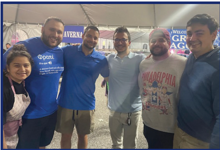
Sons and Maids Volunteer in our communities