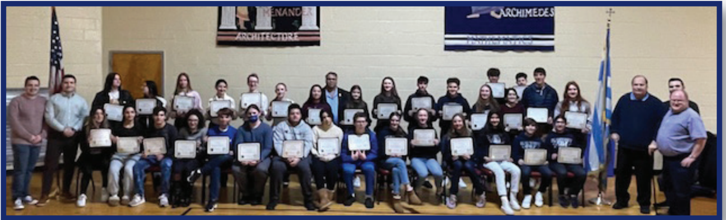
Congratulations to all participants at our annual Hellenic History Tournaments! 9 teams across multiple chapters participated this year. The tournament was held on Saturday February 17th. A wonderful turnout!