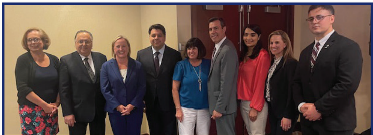
AHEPA Family representatives at reception for US Ambassador to Greece George Tsunis