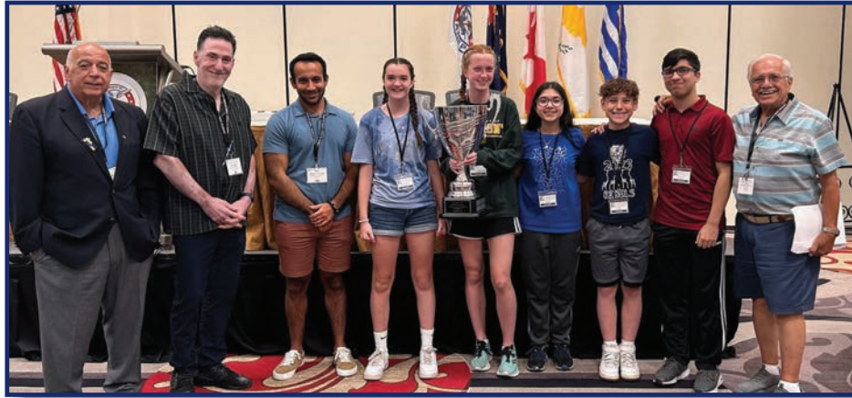
The Garden State Hellenic Heritage Team poses with their championship trophy at the Supreme Convention in Las Vegas.

In the heart of our vibrant community, AHEPA Chapter 517 embarked on another year-long journey, characterized by an unwavering commitment to brotherhood, selfless charity, and the betterment of humanity. Here's an overview of our year, marked by impactful contributions and a heartwarming sense of community: