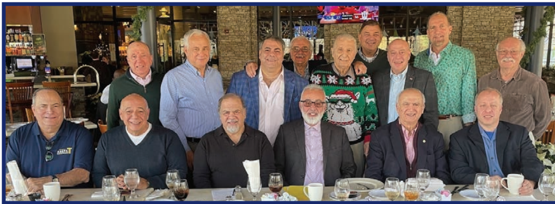
Past District Governors gathered at Jimmy's Sports Bar in Bordentown, NJ for the annual Christmas party.

The gathering was held on Saturday, December 16, 2023.